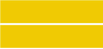
HTU-231-3/4HP Hydrostatic Test pump