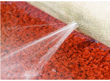
For testing safety equipment integrity, Pumptec has the pressure to perform.