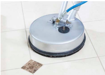
Tile, carpets, power washing and more – our flexible pumping systems can be customized to meet your commercial cleaning needs.