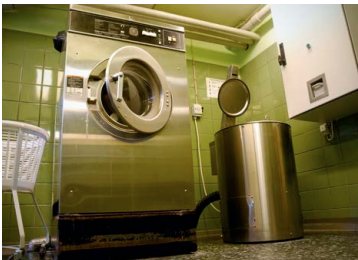
Pumptec delivers higher reliability than current commercial laundry chemical pump technologies.