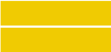
Model 114C Acid Pump