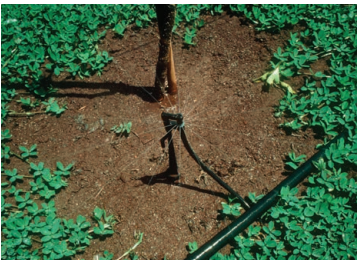
Consistent output and flow designed for the injection of nutrients or chemicals into irrigation systems.