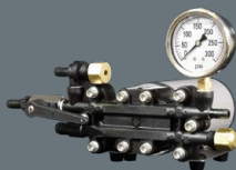
Model 314 Series