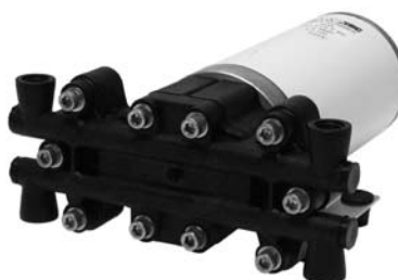
Available 4 port vertical