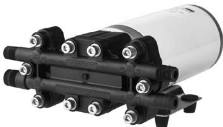
Available 4 port horizontal