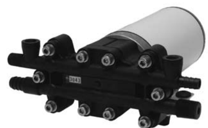
Standard 6 port horizontal